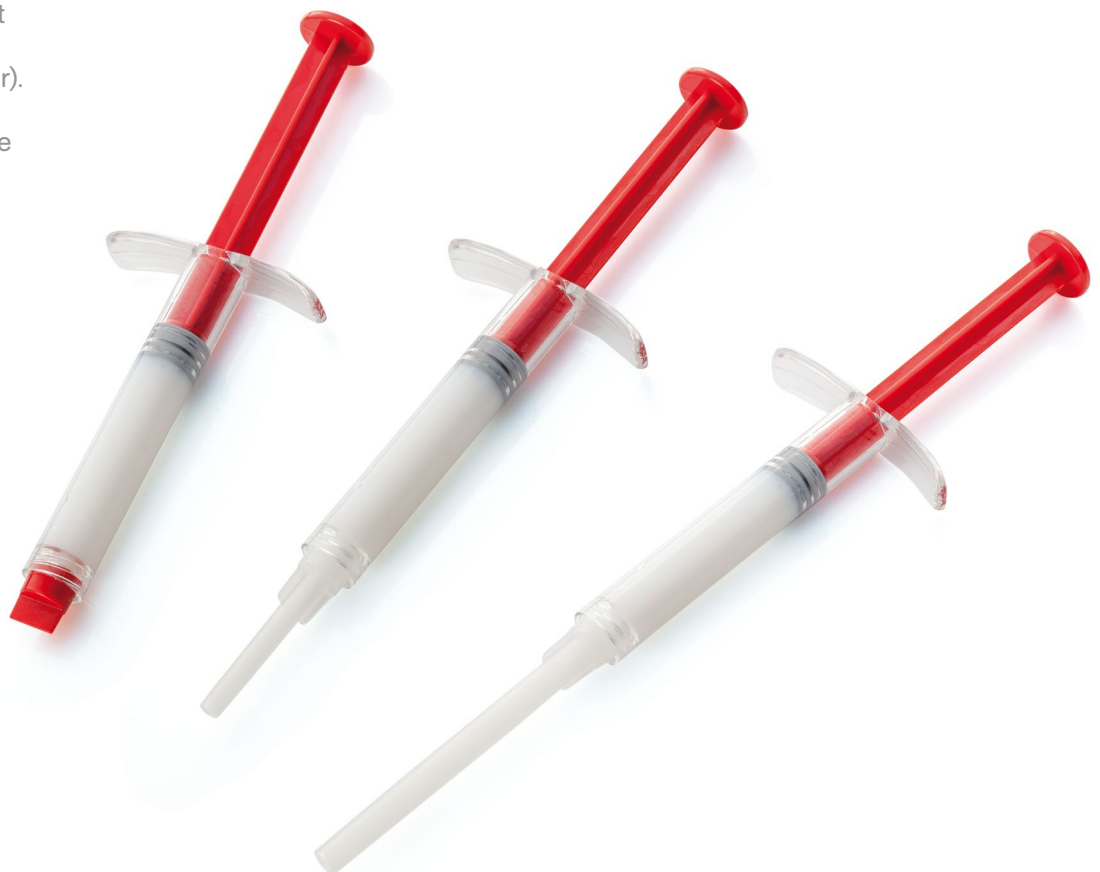
PASTE applicator / with the short cannula / with the long cannula